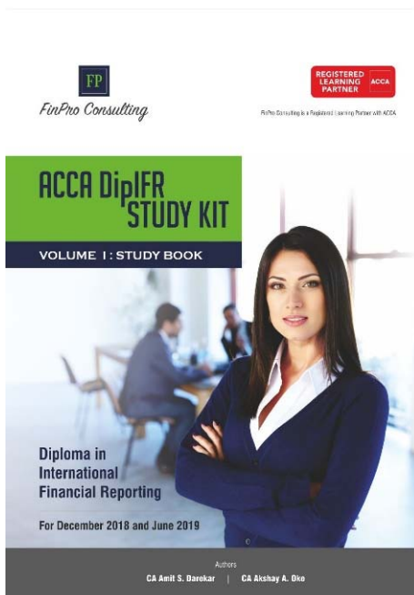
Volume I – Study Book