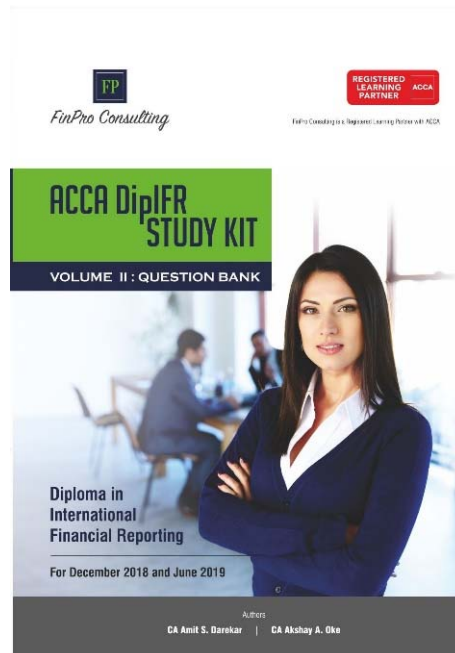
Volume II – Question Bank