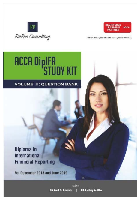
Volume II – Question Bank