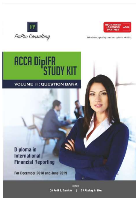
Volume II – Question Bank