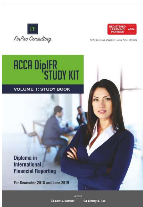
Volume I – Study Book