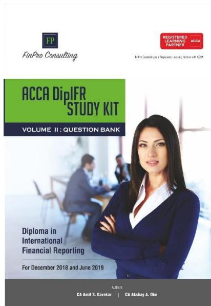
Volume II – Question Bank