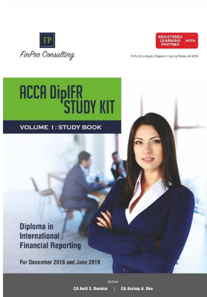
Volume I – Study Book