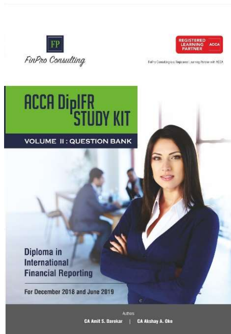
Volume II – Question Bank