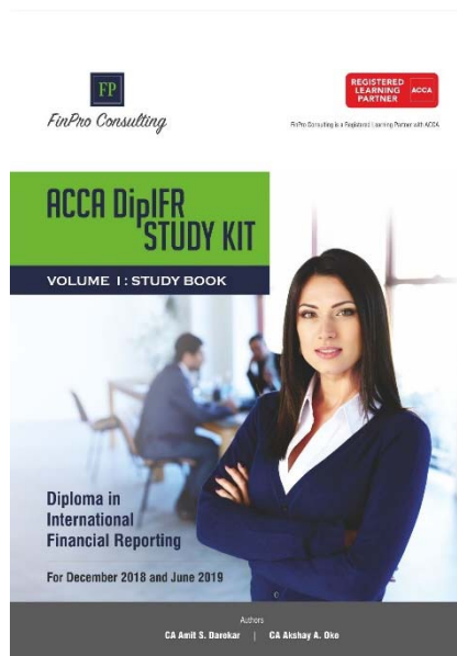
Volume I – Study Book